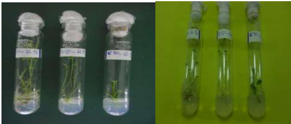
Figure 2. Effect of different hormone concentration on virus free plantlets.