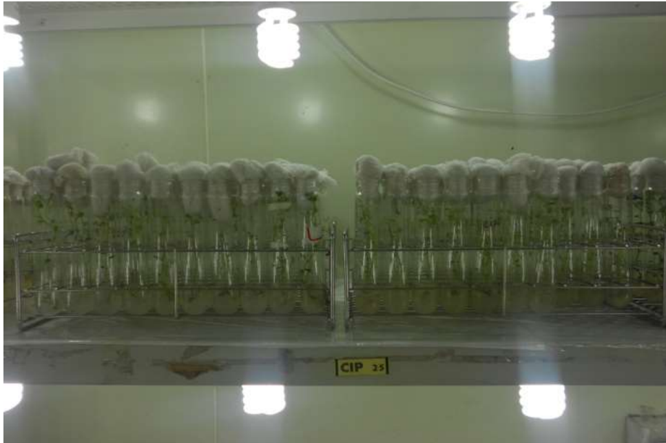
Figure 2.2 Role of sucrose concentration on virus free plantlets.